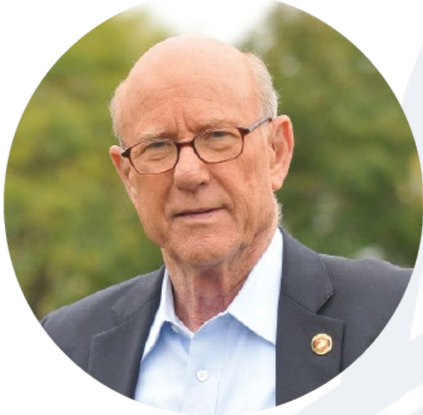
Senator Pat Roberts