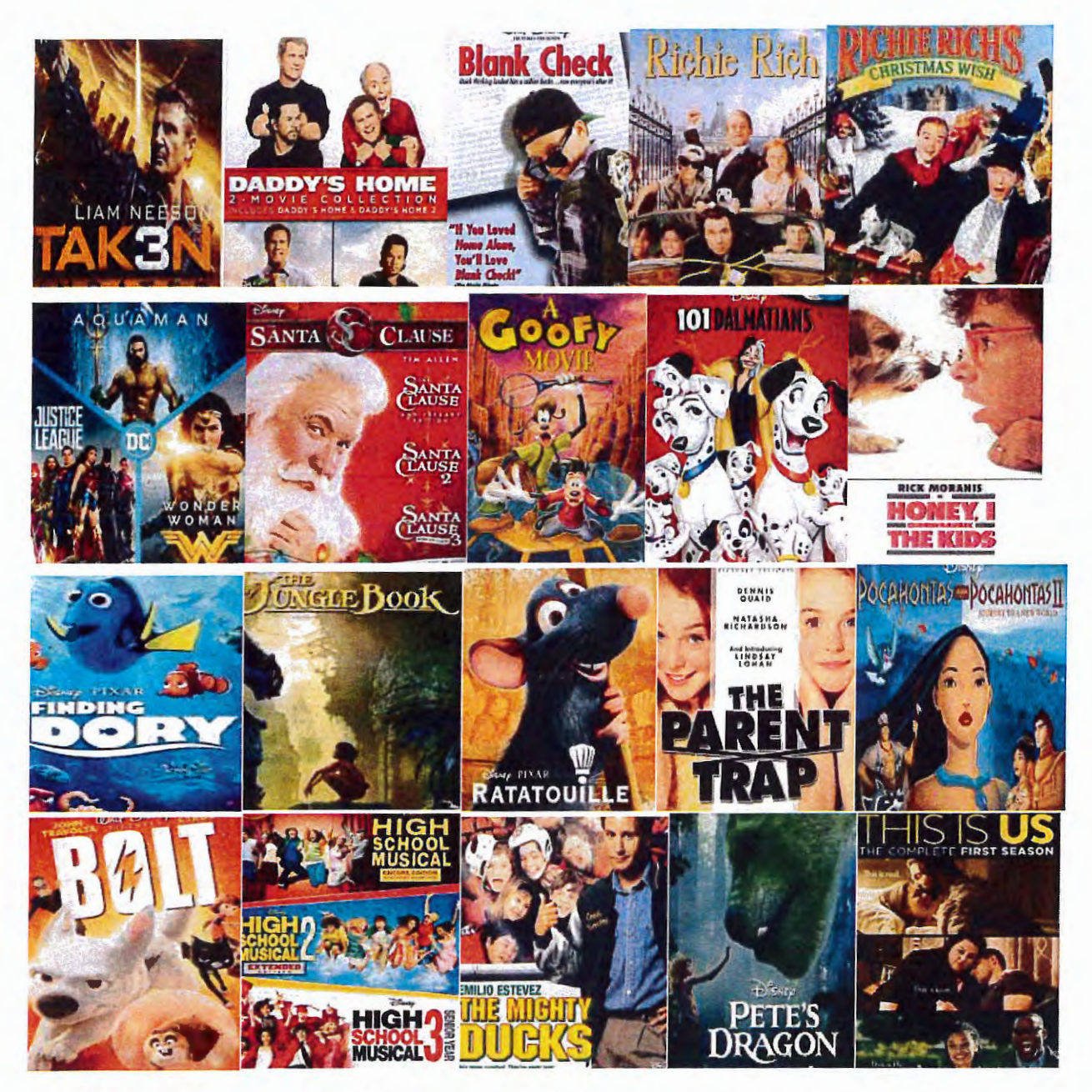
**Must be rated PG-13 and Must be approved if not on this list, all DVD's MUST be sealed**