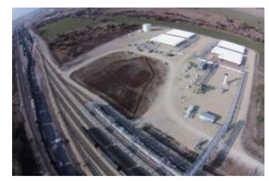
The Williams Hutch Rail Terminal in Hutchinson, Kansas, has eight rail spots and an expected 500 cars per month capacity. Click image to enlarge.

The rail terminal's eight employees are now Williams employees as a result of this acquisition, which increases our rail car capacity by 70 percent per month, enhancing our ability to move and store propane and butane for our customers.