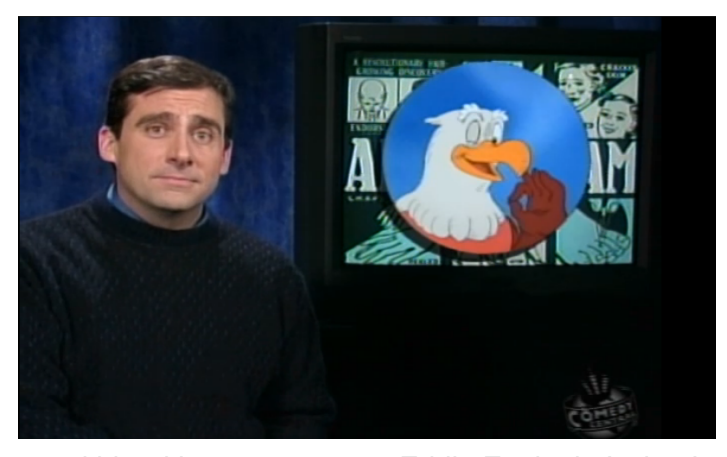
"The NRA reaches out to kids with a new mascot, Eddie Eagle: he's the Joe Camel of firearms."

https://www.cc.com/video/wz4f7m/the-daily-show-with-jon-stewart-ad-nauseam-nra