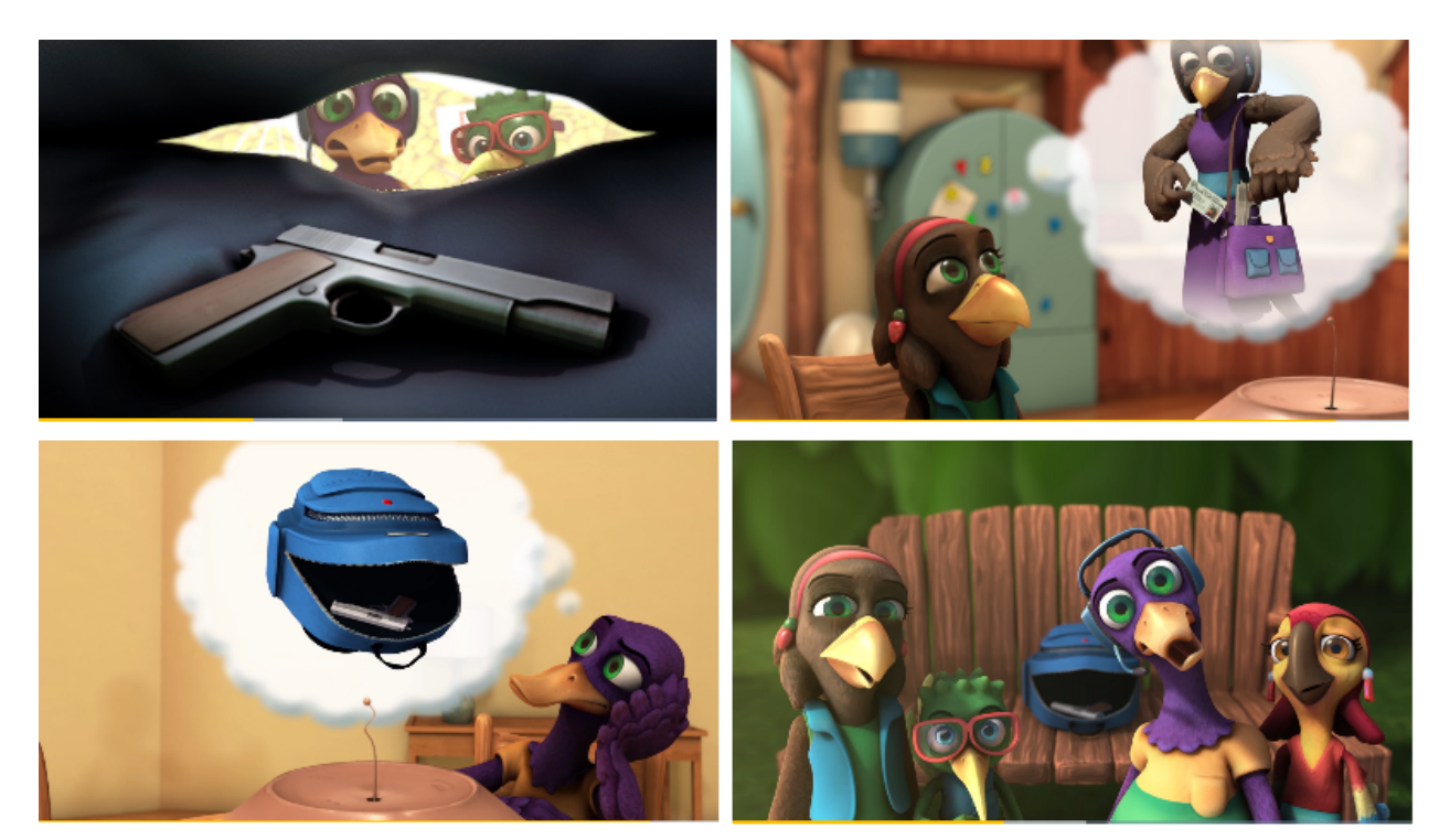
Screen shots from the NRA website - Eddie Eagle video

High levels of anxiety and depression are reported in children today. They have to participate in school lockdown drills in anticipation of mass shooters. Do we really want to subject kindergarten and grade school kids to this additional stressful "educational curriculum"?