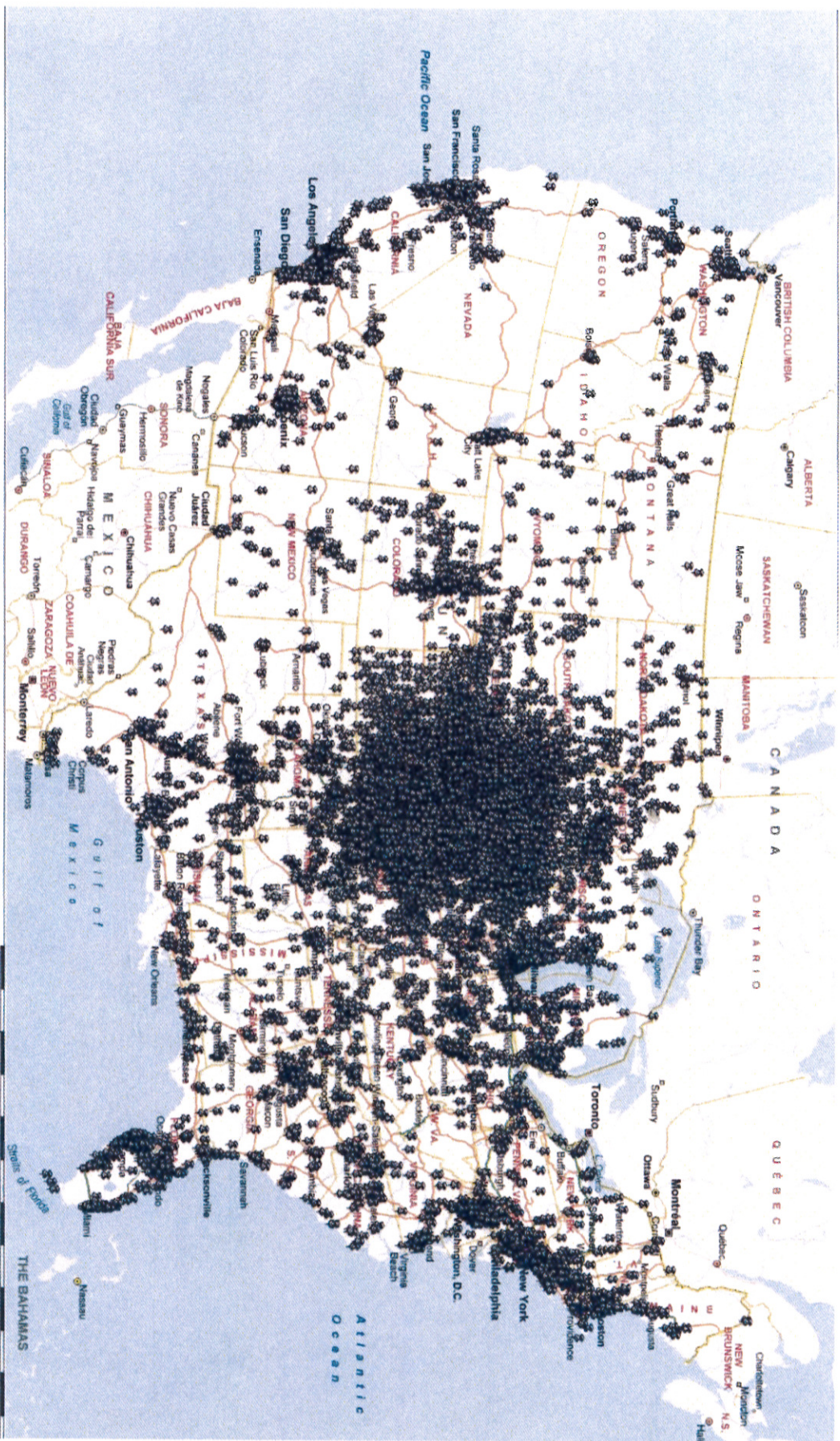
Figure 5. 2015-2016 National Crime and Justice Survey. All rights reserved. http://www.primoind.com/primosurvey This data includes information from the Canadian authorities in 1971-2002. Department of Justice, Statistics Canada and/or Statistics Canada. All rights reserved.